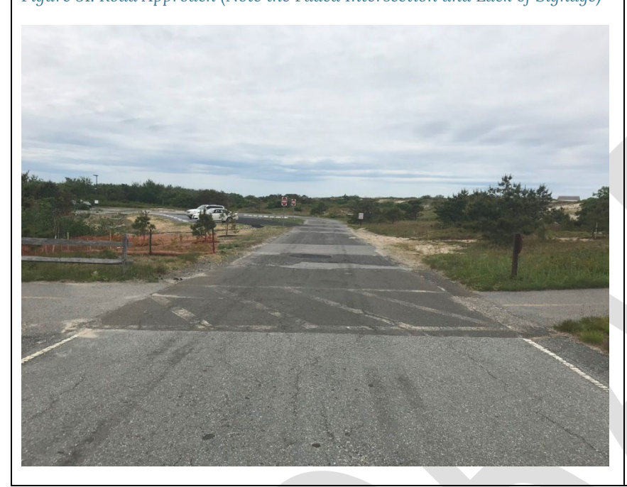
Figure 51: Road Approach (Note the Faded Intersection and Lack of Signage)