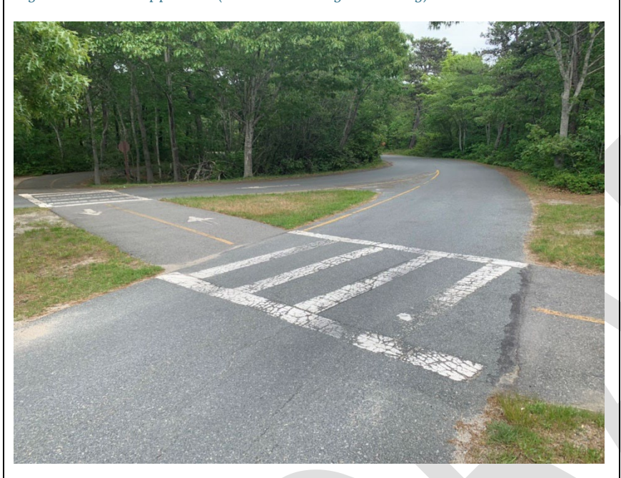
Figure 59: Road Approach (Note the 2-Stage Crossing).