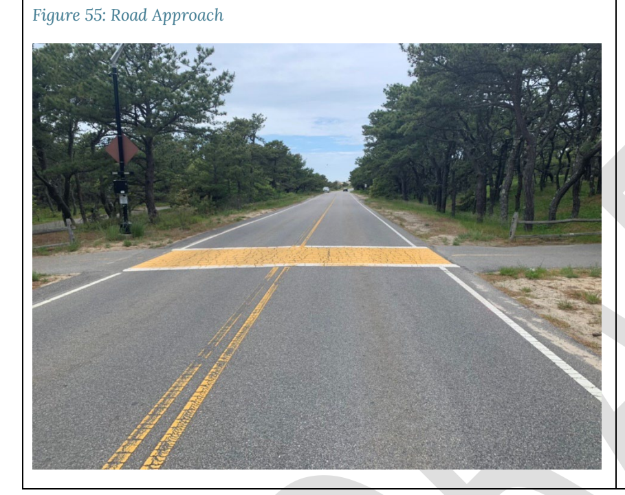
Figure 56: Path Approach STOP