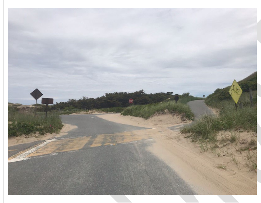
Figure 49: Road Approach (Intersection partially Covered in Sand)