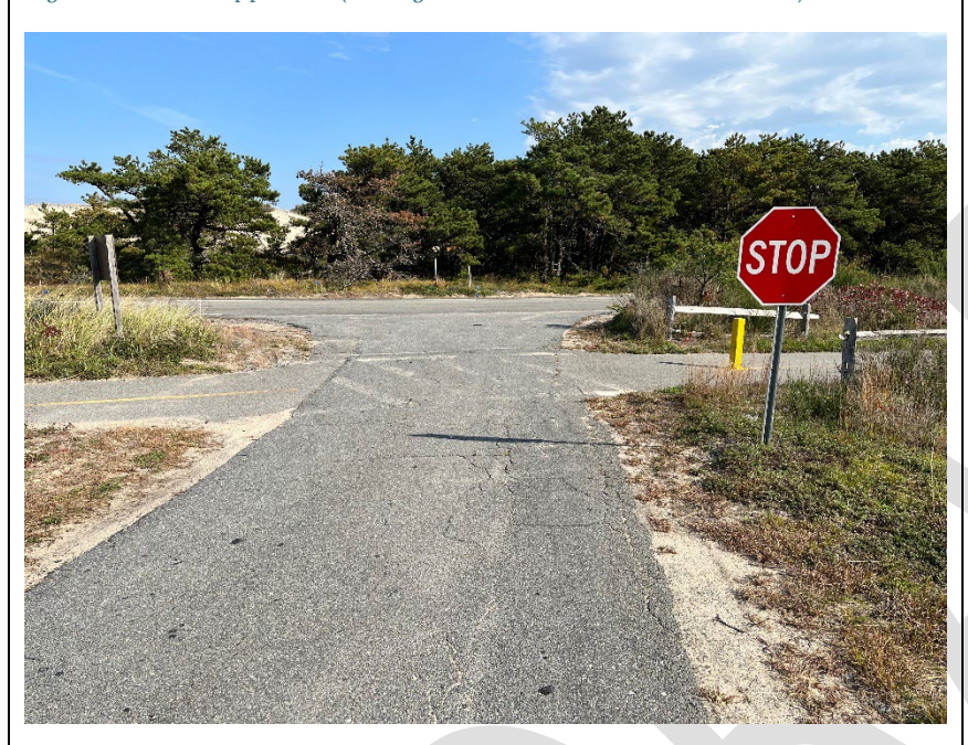
Figure 53: Road Approach (Facing East Towards Race Point Road)